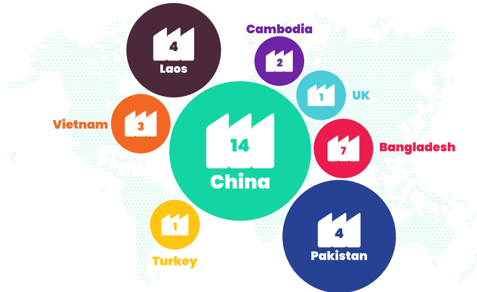
Banner Stocked Garment Production Per COO (Expressed as a % of total volume)

We work with 36 direct and indirect (sourced via agents) suppliers in 8 countries: